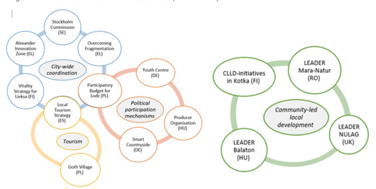
Figure 2. Examples of preliminary clusters within the 33 RELOCAL Cases